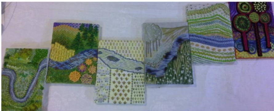
The River so far... just waiting for your piece to add to the display.