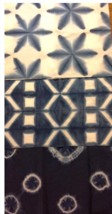
Charmaine D – 3 pieces of Shibori and Indigo dyed fabric