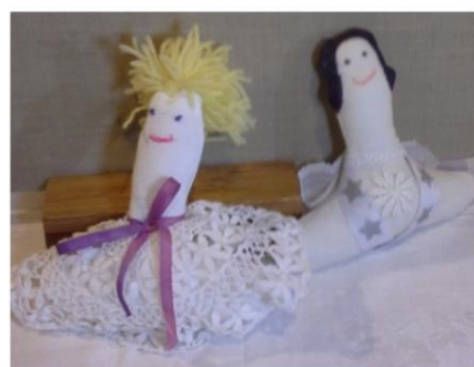
Cathie E – 2 Bust Dolls