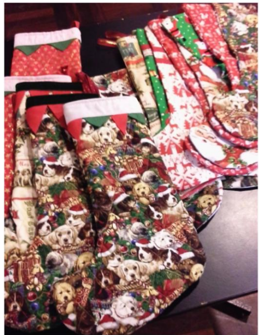
More completed Christmas stockings for the Hospital