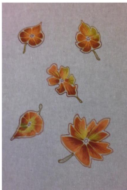
Sara K – Autumn Fruits Outrageous Orange challenge entry