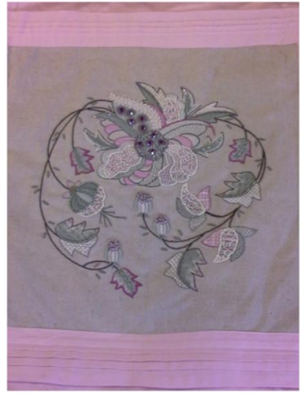
Anne B – Pillowcase from Hazel Blomkamp at Beating Around the Bush 16 in South Australia