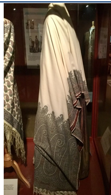
Kirking Shawl (worn when attending first church service after the birth of a child)