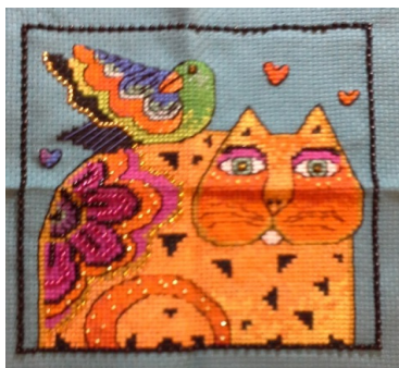
Charmaine D – Crossstitch and bead Lauren Burch Kit