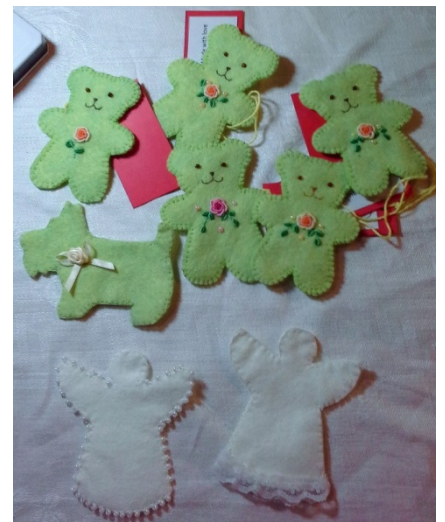
Teddies, Scottie and Angels