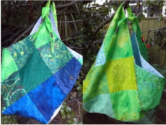
Lyn Duncan – Japanese Style Bag