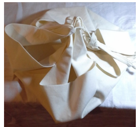
Cathie E – Bread Basket