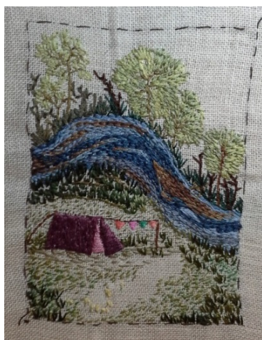
Leanne S – New Work – River

would like included in the river - just for continuity.