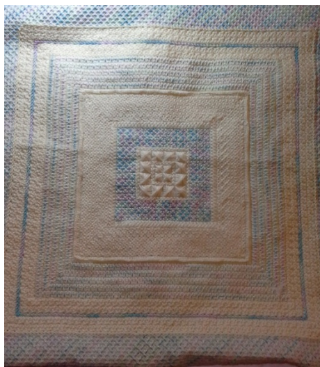
Cathie E – Canvaswork Cushion