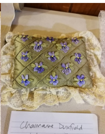
Charmaine Duxfield Late in the day