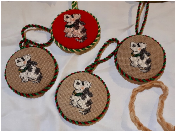
Susan W – 4 Cross stitch decorations