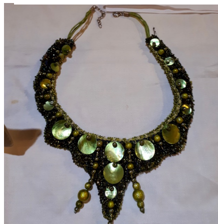
Suzi P– Elven necklace