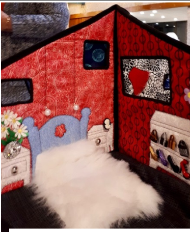
Jeanette A- fold up playhouse