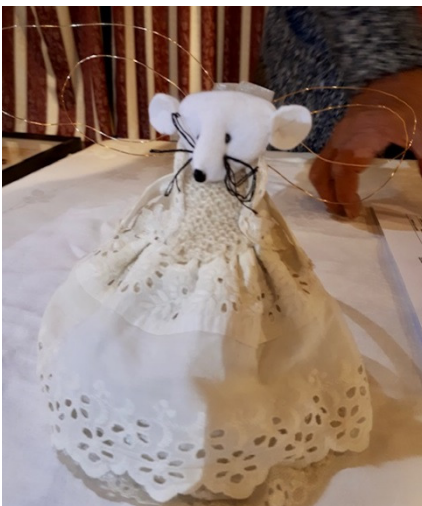
Jeanette A- Mouse