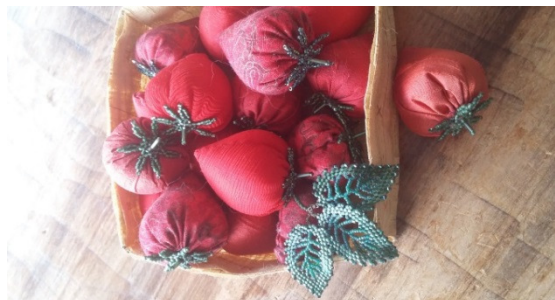
Charmaine D – 'Ingen Midsommer Utan Jordgubbar'. From our theme of the month— Summer

Another good investment is good photo editing software so adjustments can be made to the photo if required and the item can be cut out from the background.