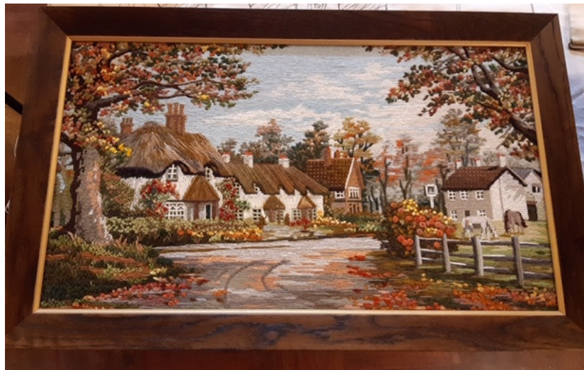
Pam B– Swan Green – Lyndhurst – Canvas Work