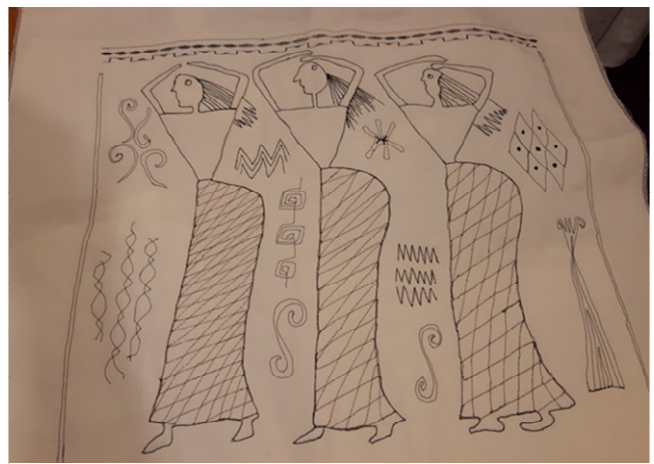
Louise H – Machine Embroidery Egyptian Ladies