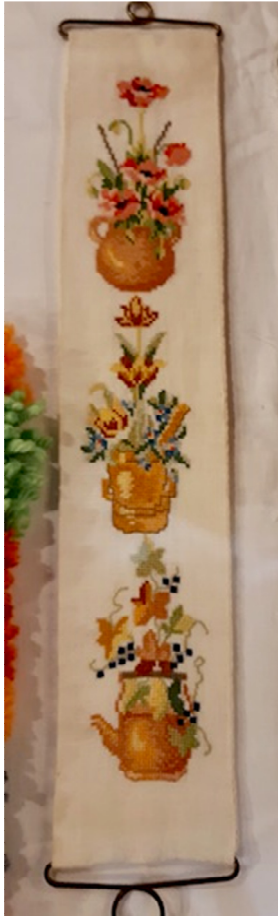
Louise H – Bellpull Cross Stitch