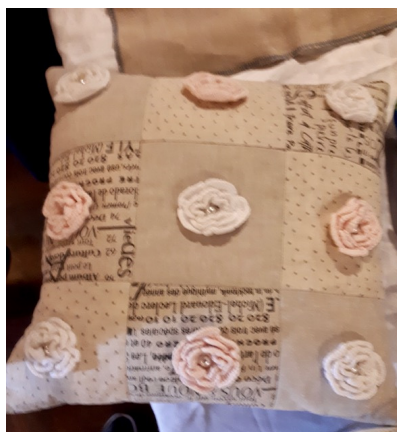
Sally R – patchwork cushion with crochet roses