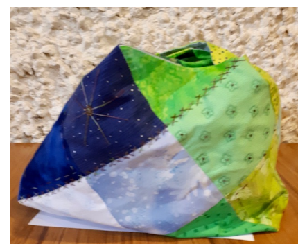
Lyn D– Japanese style patchwork bag