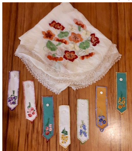
Charmaine D, supper throw and serviette rings