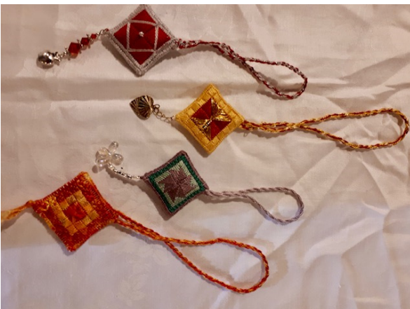
Joan A – 4 fobs for conference