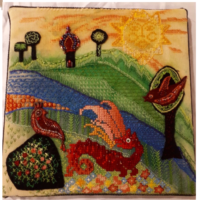
Suzi P – , Hundterwasser (at last!)