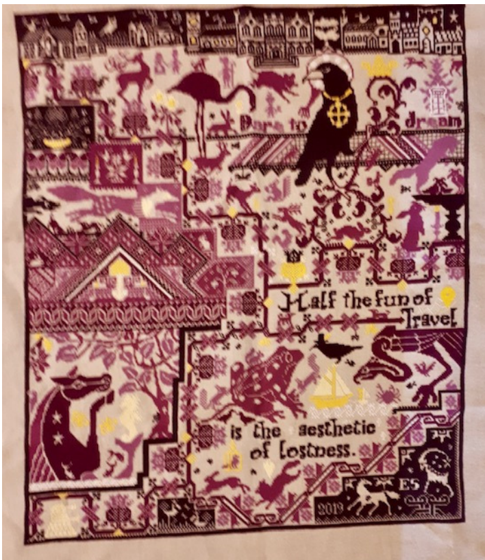
Lis S – The Pilgrim (Long Dog Sampler) can you spot the dalek or tardis - Lis introduced them to the pattern