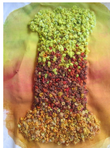
Letter I

At this stage we would like them completed by early June, but as we are unsure of what is happening at this stage please hold onto your pieces until we know more, but be ready to deliver in early June.