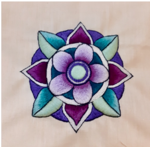
Trish Burr, level 1 needle shading