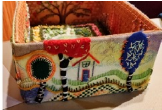
Pam Bailey, box, garden with wall