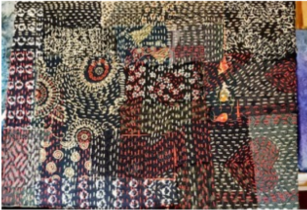
Anne Whitehead Boro hanging and cotton cushion cover