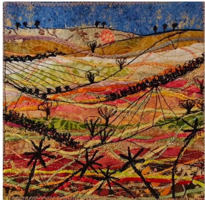
Charmaine Duxfield "Happy are Those" hardanger tulle