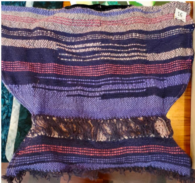
Rhainnon Mckinstry , purple woven tunic