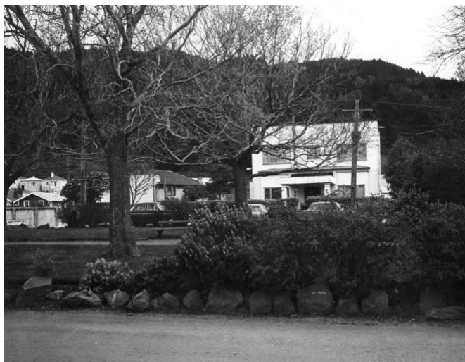
38 Fitzherbert Terrace, Thorndon. Constructed in 1926, this was the last house of the western side of Fitzherbert Terrace before it intersected with Molesworth / Murphy Street at its southern end. Demolished shortly after this photograph was taken in 1967 for the construction of the Wellington Urban Motorway.