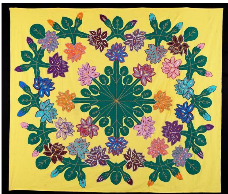
Mere Tapaeru Tereora; 1980; Cook Islands from the Te Papa collection.

Tivaevae are treasured quilts made by women in the Cook Islands. They are made from brightly coloured fabrics, and designs can include geometric shapes, flower and animal designs. Some of the designs are appliqued onto the backing and the enriched with embroidery. Grace not only cares for the beautiful and numerous quilts held by Te Papa but is also a practitioner of this art herself.