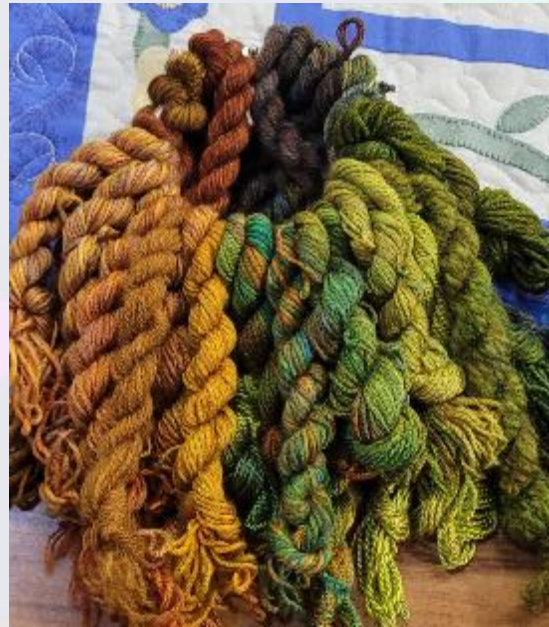
Thread and wools by Lyn

These gorgeous dyed threads and fabrics were the result of Extensions classes.