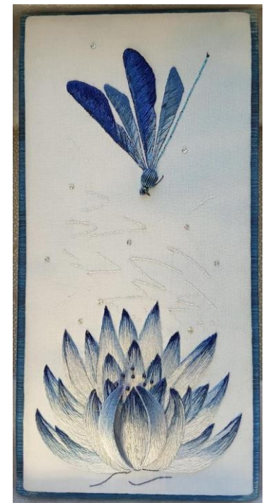
Merit award winner Fiona Crowther- Aker - Aoraki The Blue Lotus and the Dragonfly