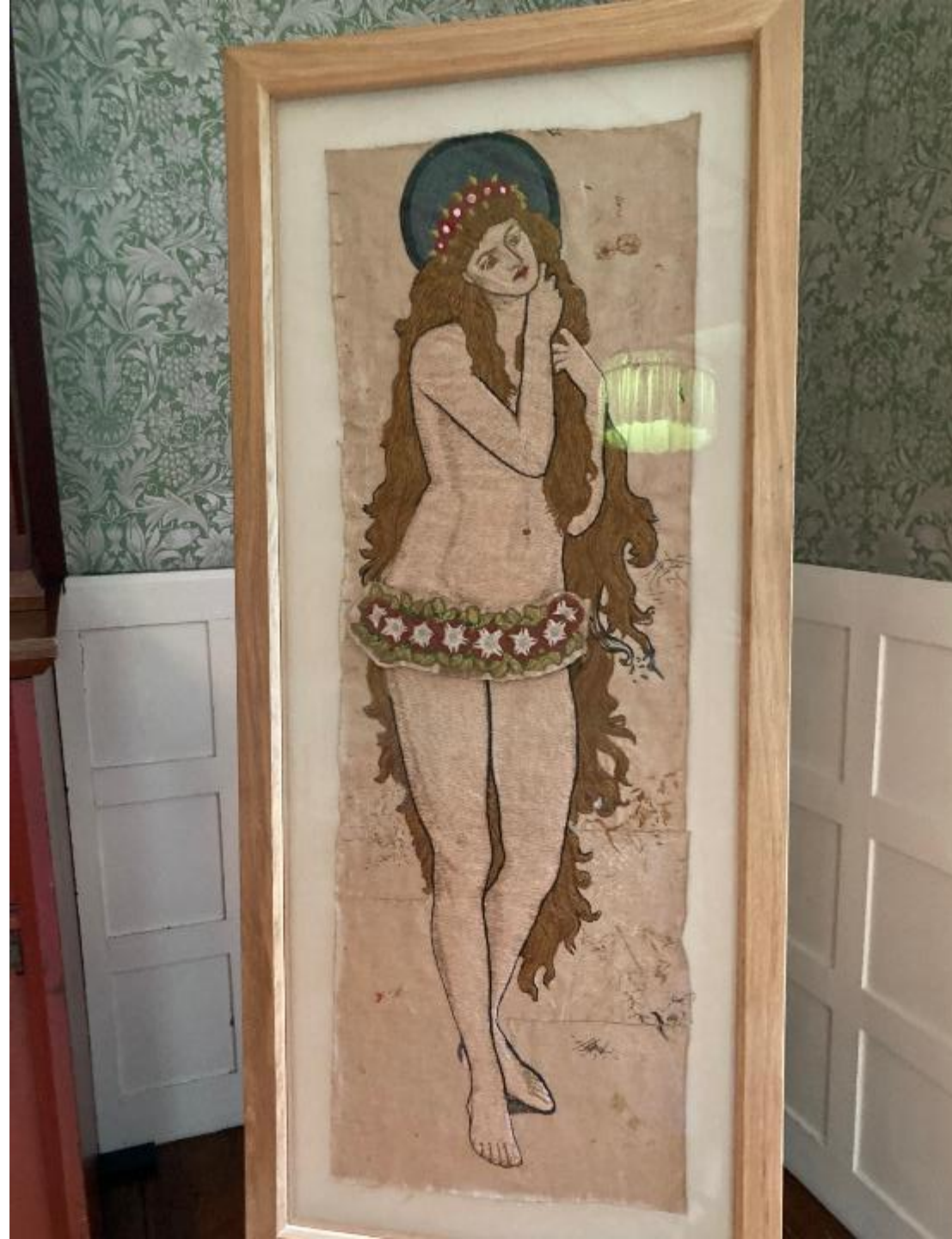
An unfinished wool and silk embroidered panel (1860-65), designed by William Morris and made by May Morris, on display at the Red House in Bexleyheath.